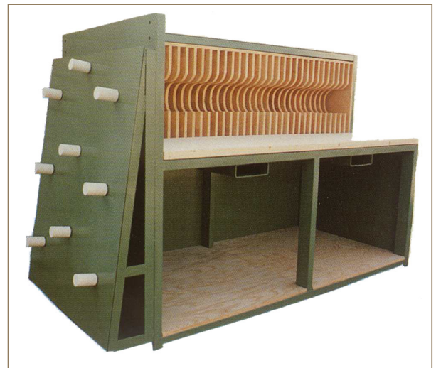
Knife Storage Cabinet with Spacer Storage and Work Table

Call 847-707-7185 or email jasinskied@gmail.com