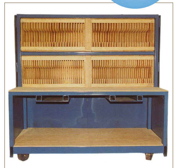
Knife Storage Cabinet with Work Table