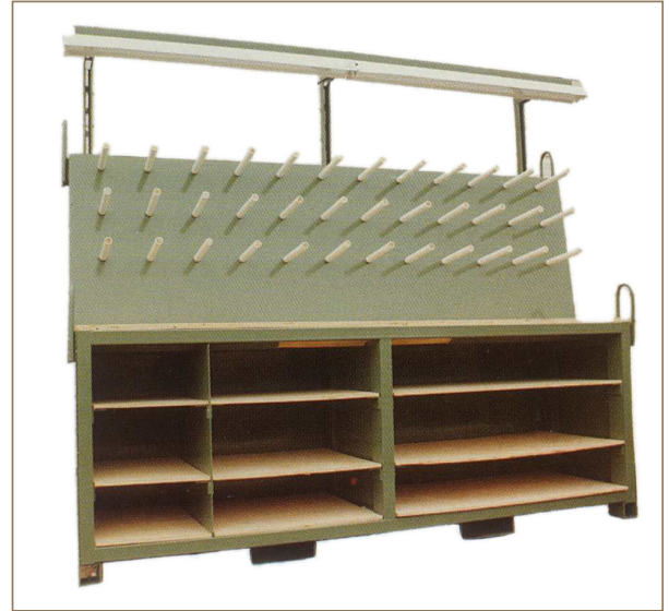
Spacer Storage Cabinet with Work Table