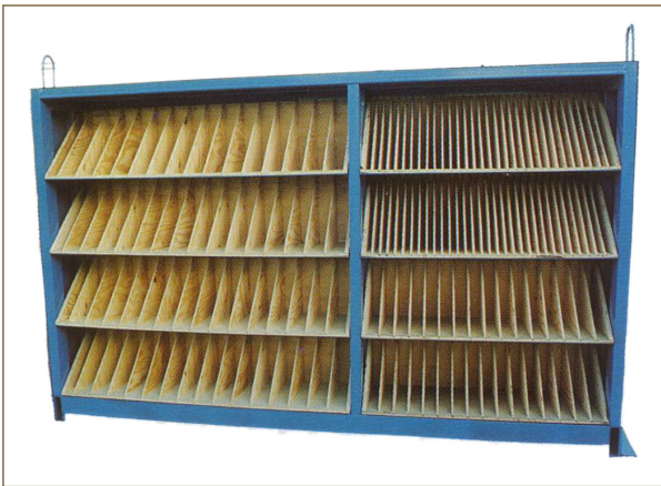
Bookcase-style Spacer Storage Cabinet