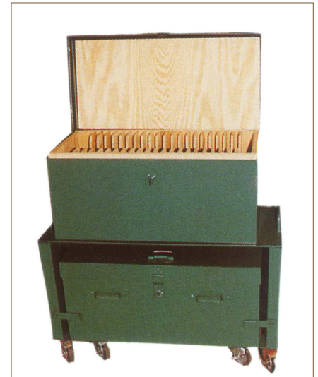
Knife Storage Box with Carrier